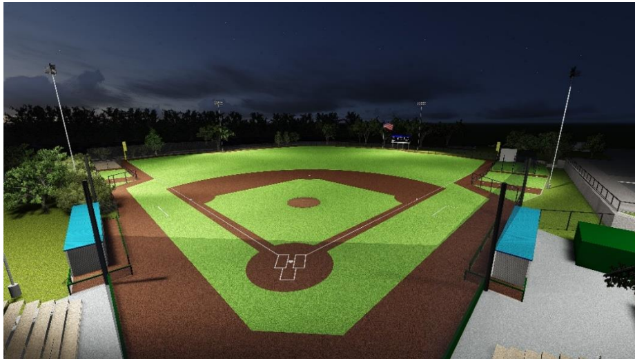
Reviewed and Approved September 2020: WPRF Board